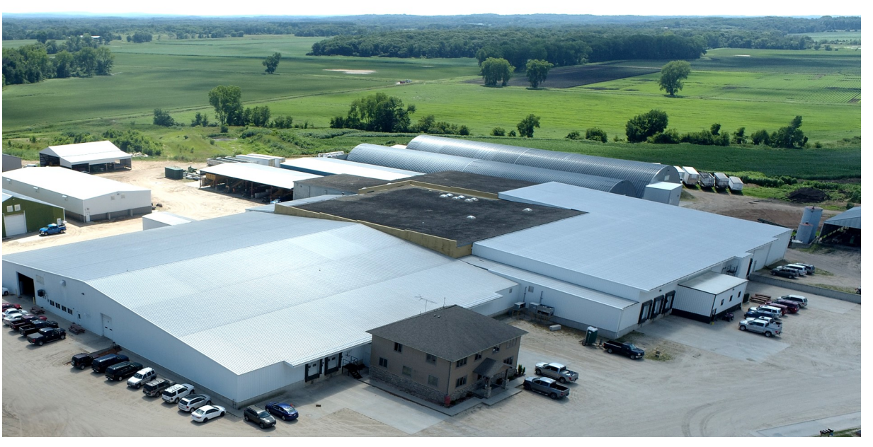
Largest onion grower and fresh market red and yellow potato grower in the Midwest

Potatoes— 3#, 5#, 10#, 15#, 50#, bins, RPCs, totes