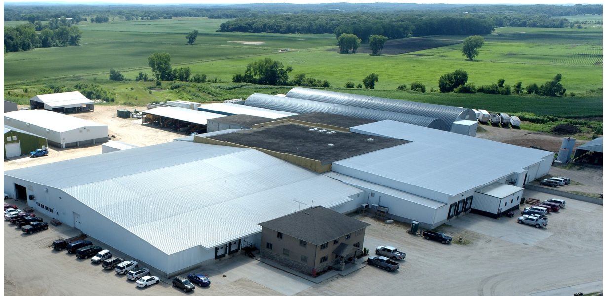
Largest onion grower and fresh market red and yellow potato grower in the Midwest

Potatoes —3#, 5#, 10#, 15#, 50#, bins, RPCs, totes